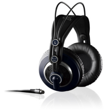
K 240 MK II

→ High-resolution image (JPG, 981,45 KB)